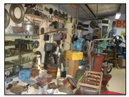
In the Bread Museum in Fismes, France, Mr Boizard collected everything to do with bread under one roof!

in World War I the Germans machine-gunned the blades off the windmills because the French Resistance used them to point out where enemy bunkers were hidden and munitions stored.