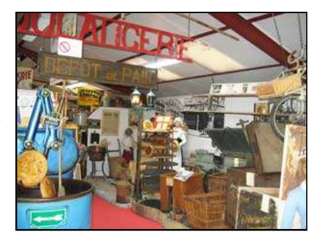
In the Bread Museum in Fismes, France, the floor to ceiling displays made it obvious that bread was truly M. Boizard's passion.

Everything from animated displays to antique examples of bread making art. I even watched a video in English showing how French bread was