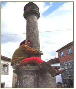
Festivals Around the World